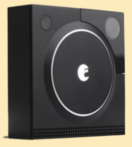
August Doorbell Cam Pro

It's 3 a.m. You and your family are all tucked away in your beds, snoozing away. Suddenly, the doorbell rings, and everyone is shocked awake. Who is that? What do they want? And, most importantly, what should you do?